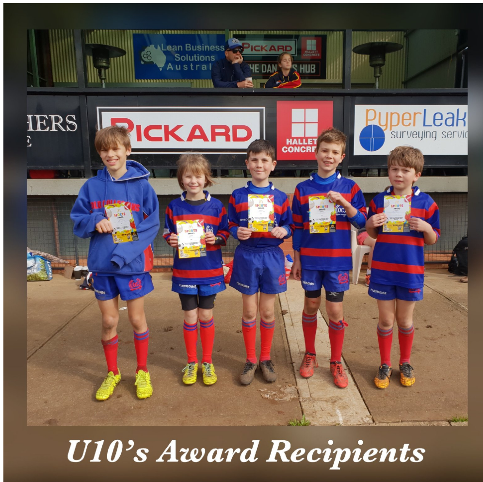
U10's Award Recipients

Ps Dads and Mums please get your young players at the field of play by 8am on game day and by 6pm on training nights.